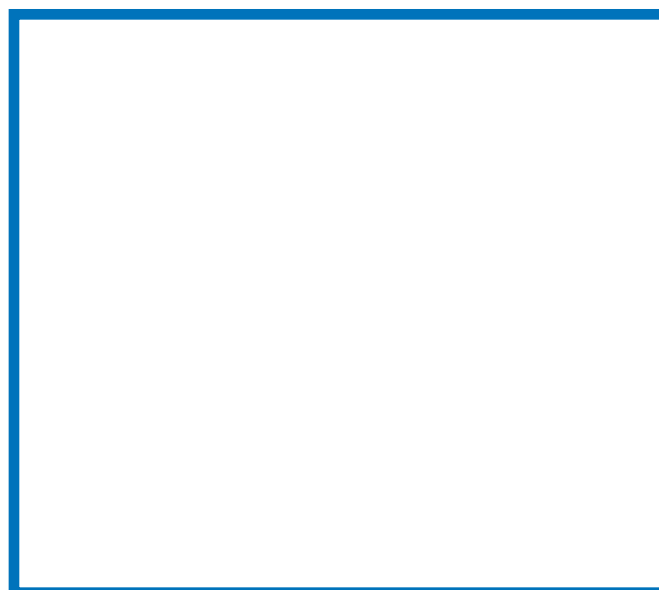
Photo of a polycrystalline diamond tip used for field emission experiments, presented at Transducers '99. As with this structure, the conference was also many-faceted.

After the opening session and the special celebration talk the conference preceded with